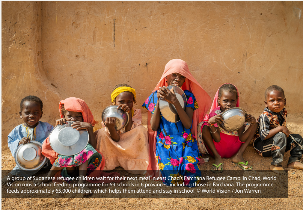
A group of Sudanese refugee children wait for their next meal in east Chad's Farchana Refugee Camp. In Chad, World Vision runs a school feeding programme for 69 schools in 6 provinces, including those in Farchana. The programme feeds approximately 65,000 children, which helps them attend and stay in school.